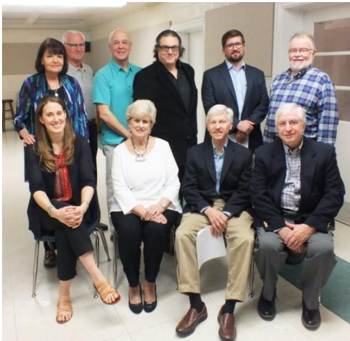
Above photo of the Clergy we celebrated.